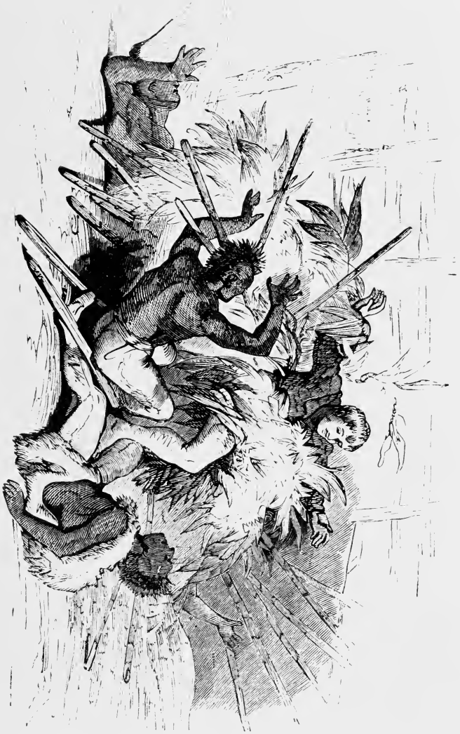
BOLD STRAGGLES OF MOON